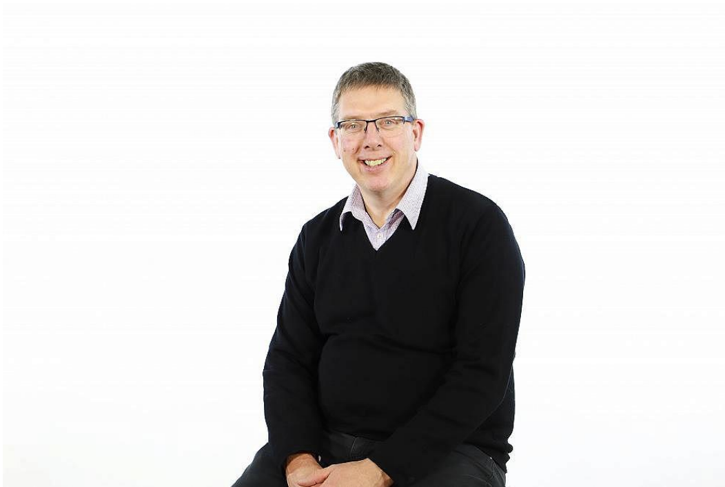
Corporate Services Introduction