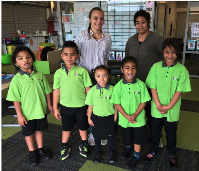
Ormiston Primary Provision