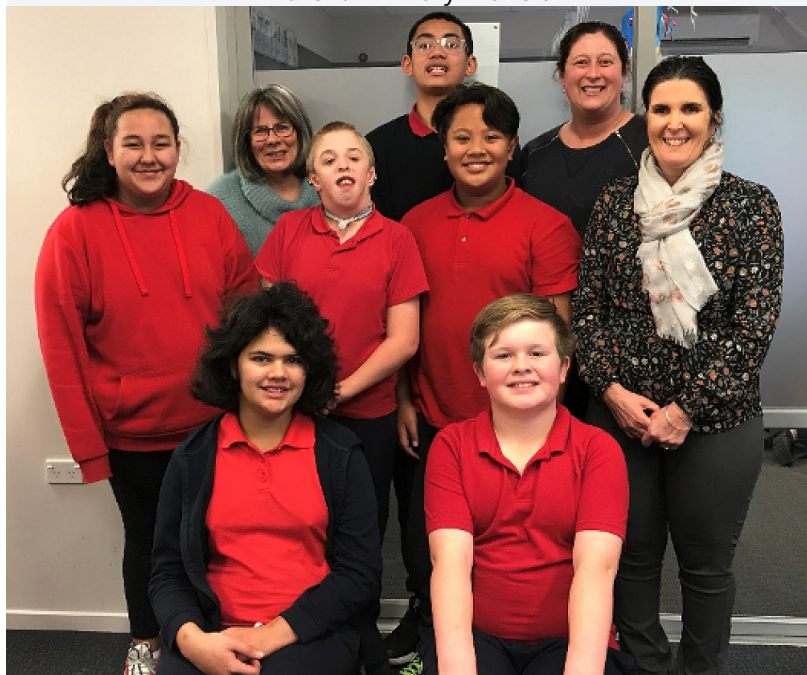
Wharenui Primary Provision