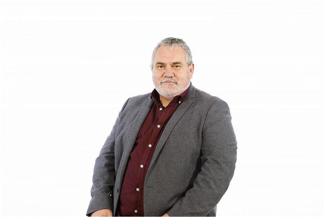
Executive Principal Introduction