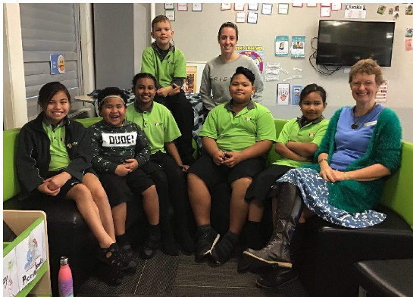
Ormiston Primary Provision