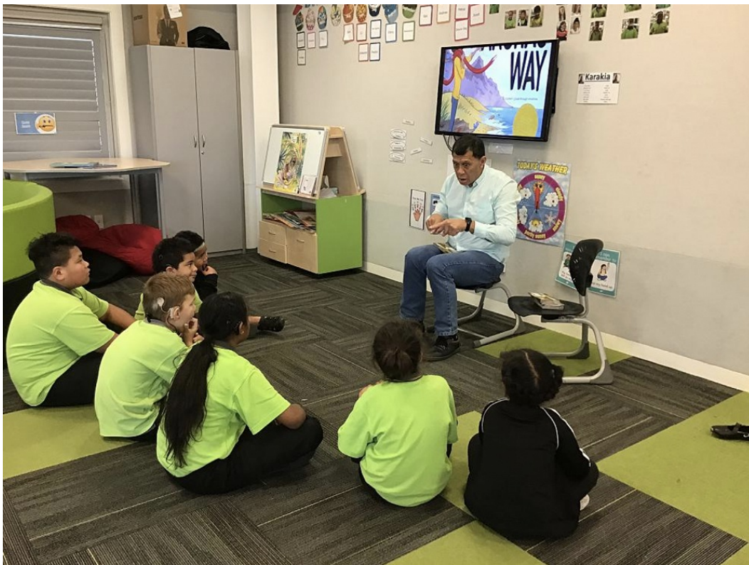
Education Outside the Classroom at Ko Taku Reo