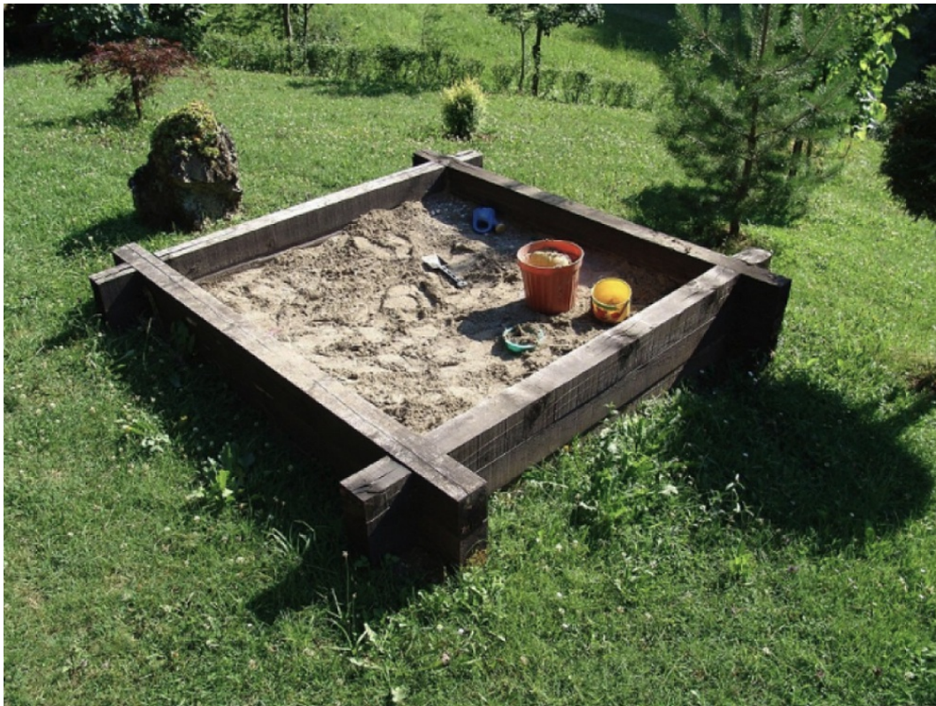
Playing in the Sandpit