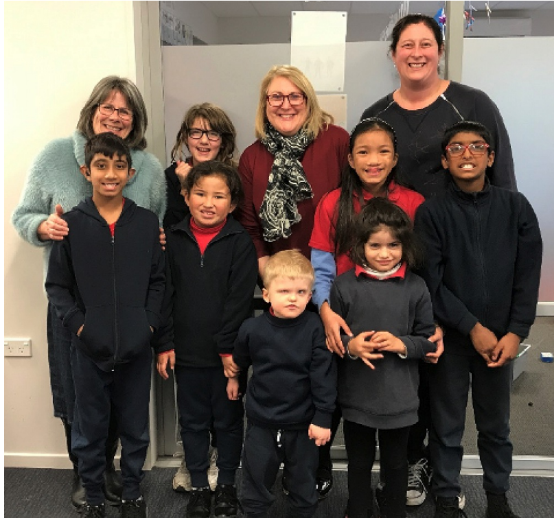
Wharenui Primary Provision