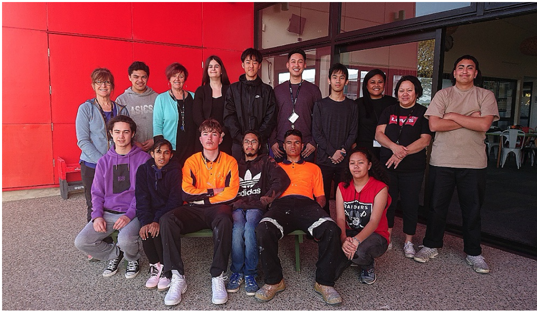
Residences in Christchurch and Auckland