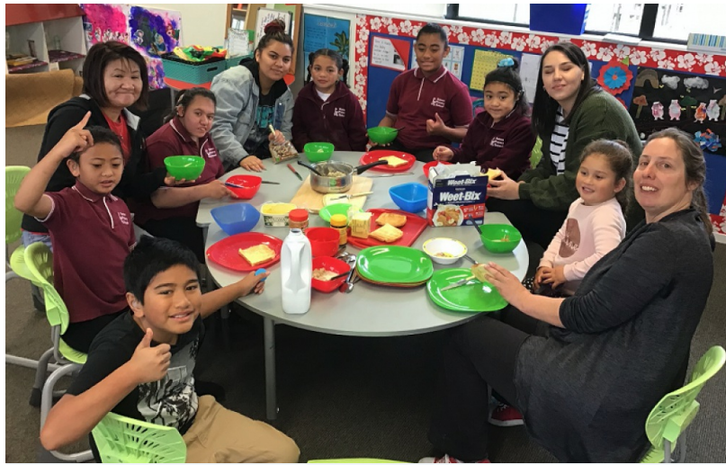
Kelston Primary Provision